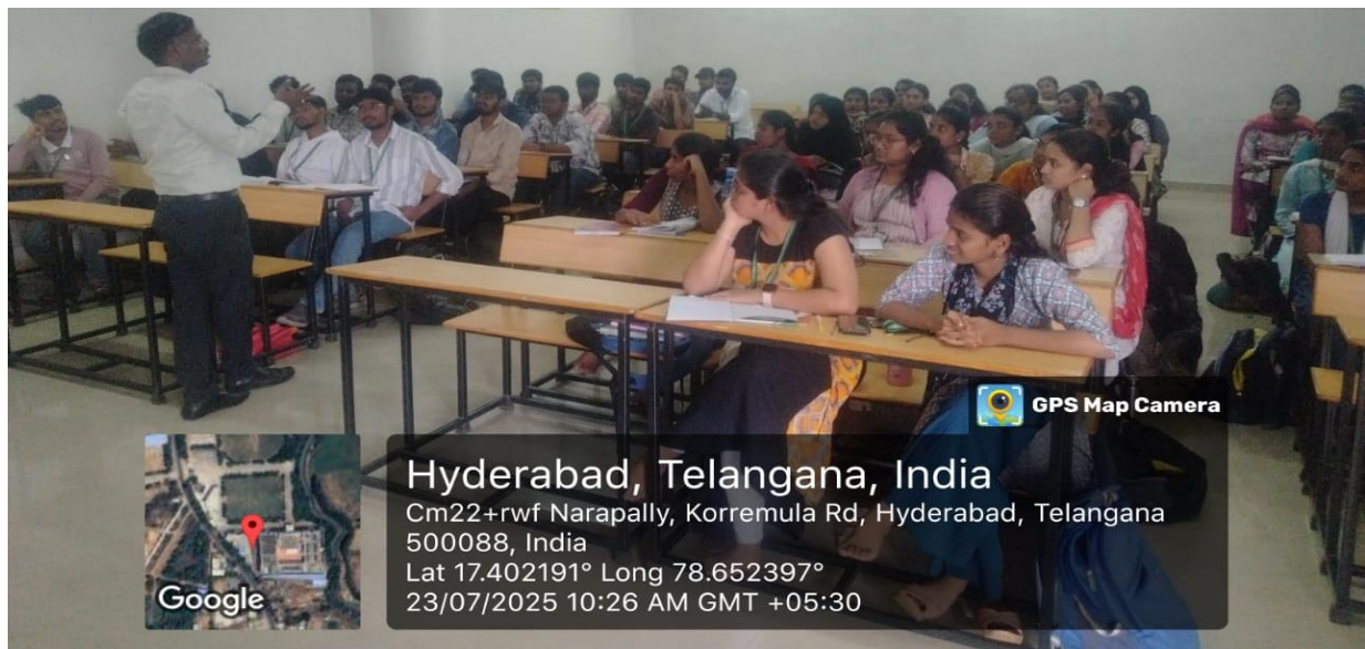
Career Guidance Program on GPAT & NIPER for Final-Year B. Pharmacy Students